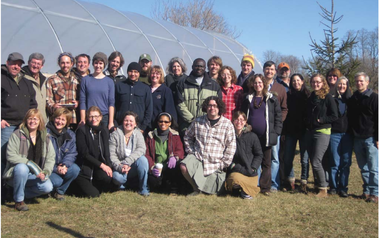
Stateline Farm Beginnings Class of 2010-2011 (Year 6)